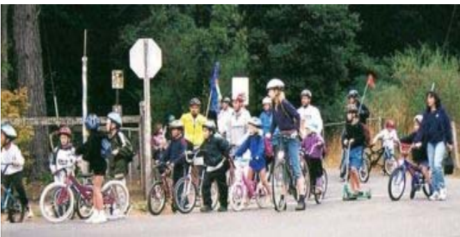
Students in Marin County, CA participating in a Safe Routes to School program.

Unfortunately, this is one lesson that just isn't being learned. According to the U.S. Centers for Disease Control and Prevention, 30 years ago two-thirds of children were walking and biking to school. Today, less than 10% walk or bike.