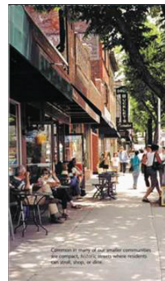
A slide from the Power Point presentation.

Imagine all of this in Memorial's backyard.... Hastings Way!