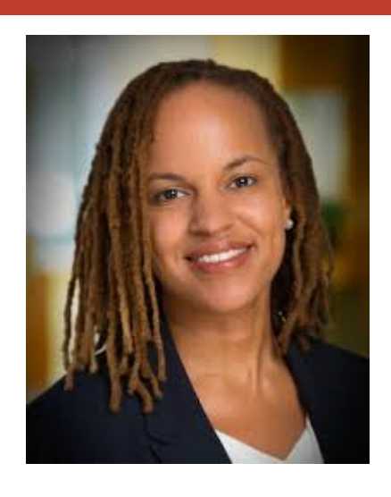
Webinar Recording: Creating Healthy Communities - addressing the health costs of racism The Creating Healthy Communities: